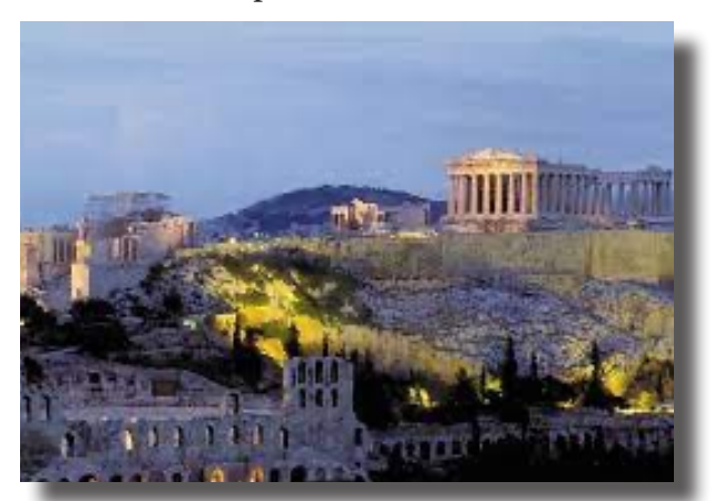
The Acropolas in Athens

Not Included: Cancellation Waiver and Insurance of